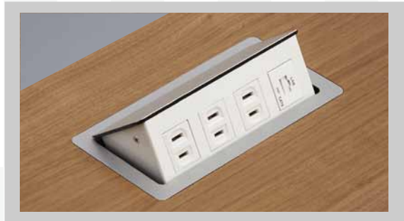
Highly Functional Power Outlet