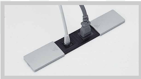
Highly Functional Power Outlet