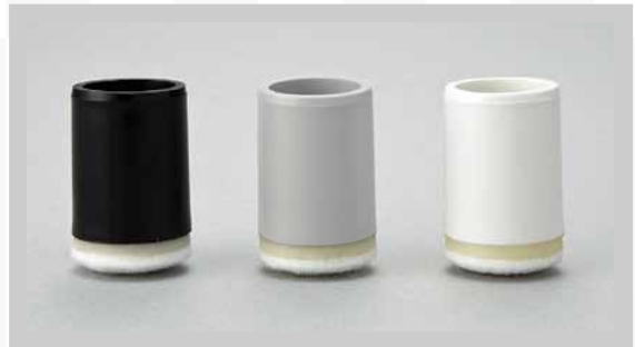
PLA-PART of Furniture Feet