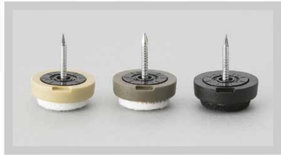
PLA-PART for Wooden Furniture Glide