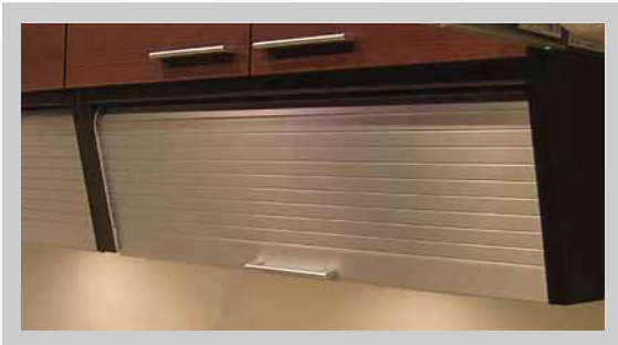
Plastic Window Shutter